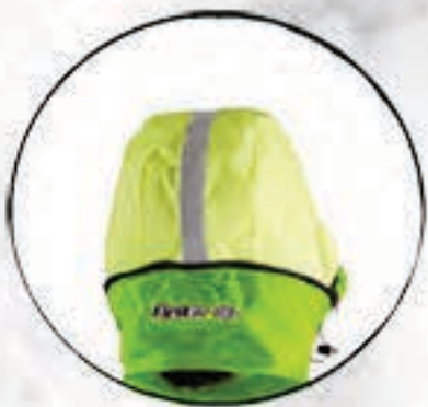
Neoprene Inner Cuff