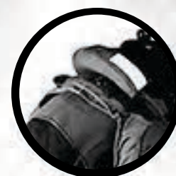
MOLLE Shoulder Adjustment Straps