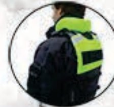
Adjustable Shoulder Straps