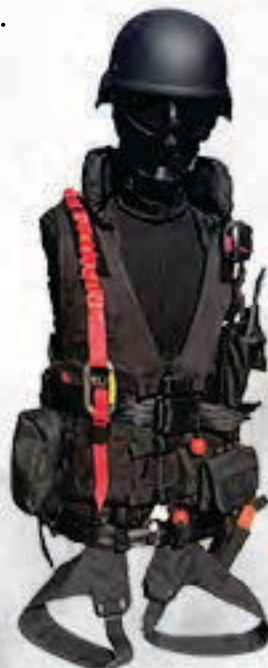
Example of full tactical loadout on vest using MOLLE