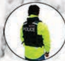
Velcro Back Patch