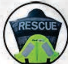
Hook & Loop Patch Sold Separately