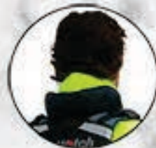
Support Collar with Mesh