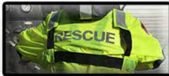
Reflective Rescue Markings

Universal fit (Built to fit 5' - 0" to 6' 4")