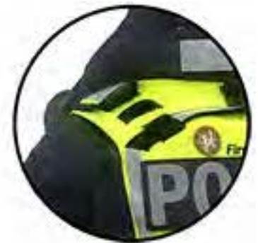
MOLLE Shoulder Adjustment Straps