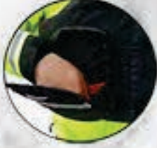
Internal Pocket Organizers