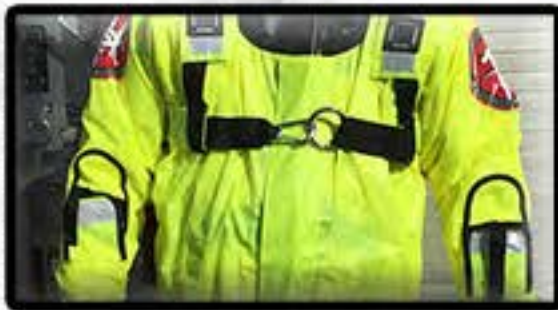
Protective Center Zip Flap